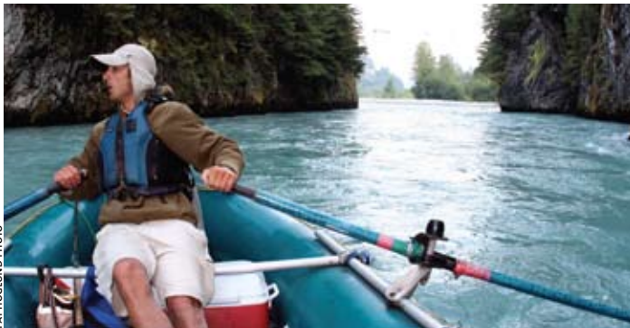
Rowing through the canyon walls on the upper Pitt.